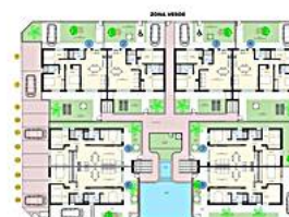
PLANO GENERAL PLANTA BAJA