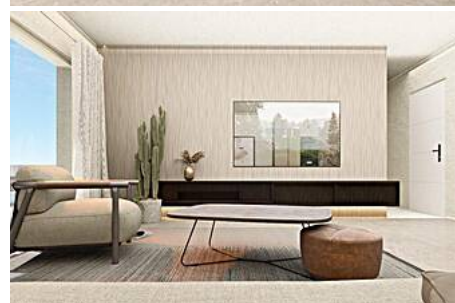
PLANO GENERAL PLANTA BAJA